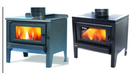
HOBSON & FITZROY