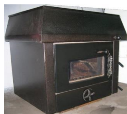
OLD MODEL MULTI