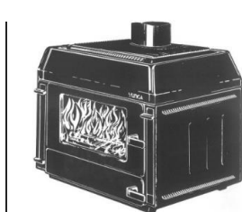
NEW MODEL MULTI