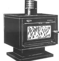
QEWB (Old Model)