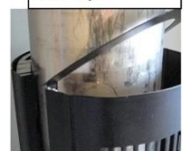
Fig 2 Below: Ensure the screw fixing the angled deflector faces towards you